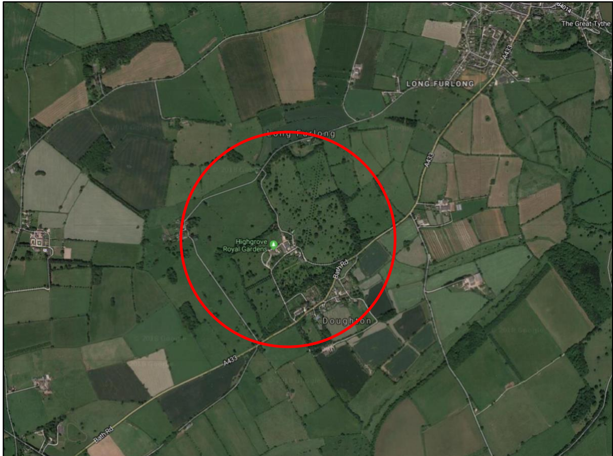
Figure 1. Highgrove House Prohibited Area (HHPA)